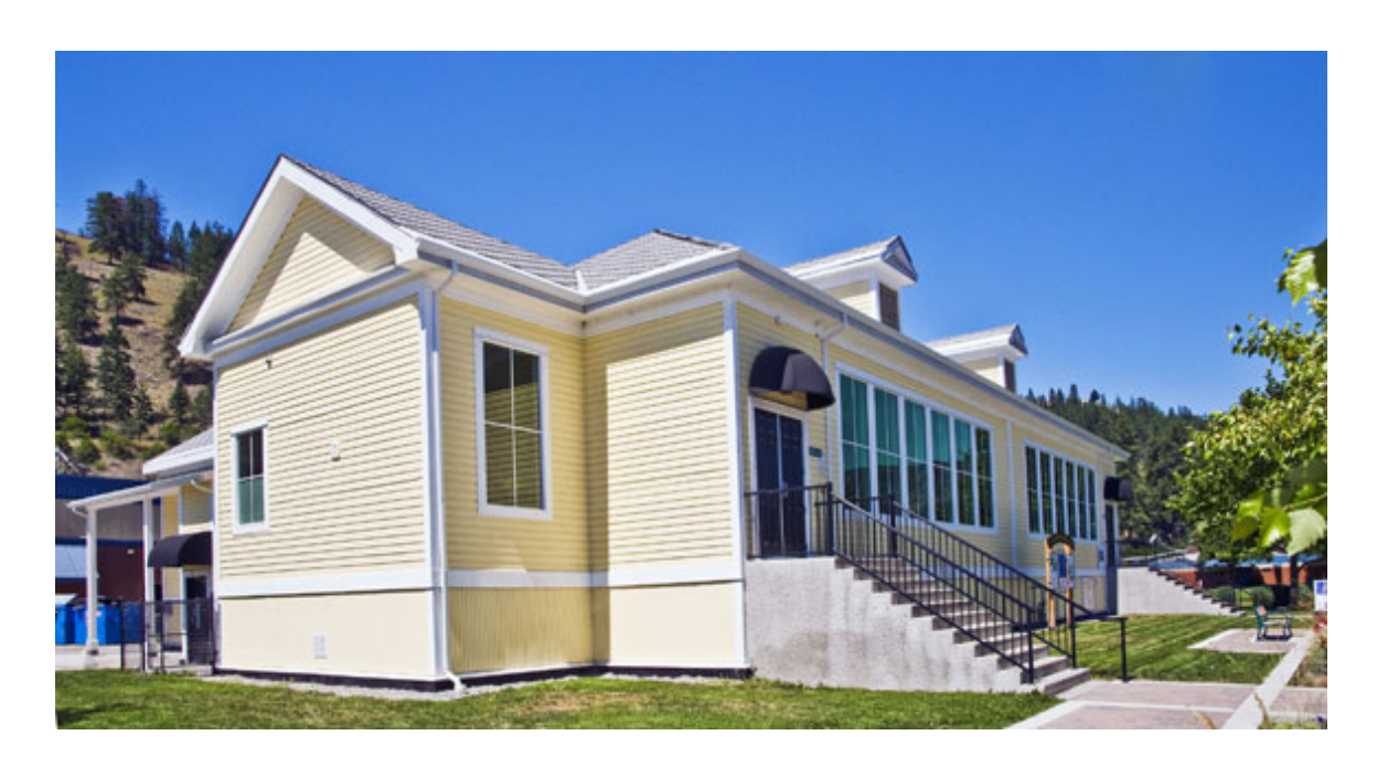
The Yellow Schoolhouse, Peachland